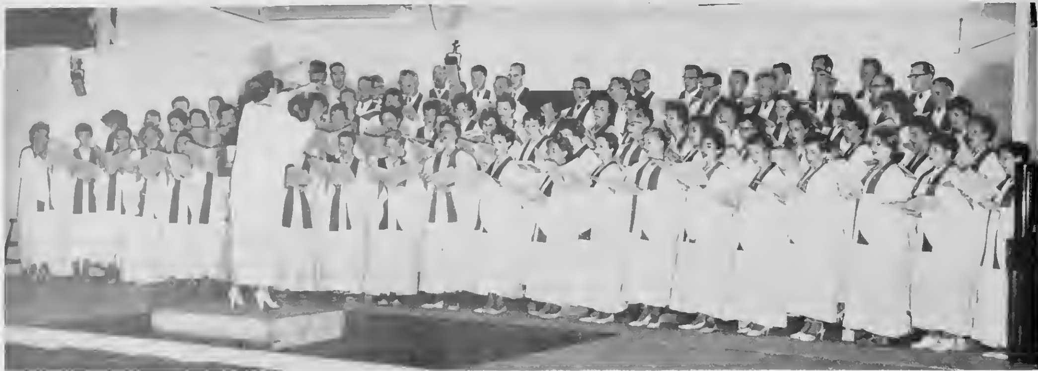
THE LAGO Community Christmas Choir as it appeared before the capacity audience at the Lago Sport Park Dec. 18 when it presented its first San Nicolas concert.